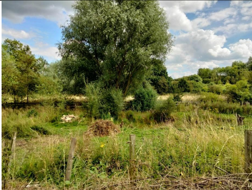
BIRD WATCHING AREA